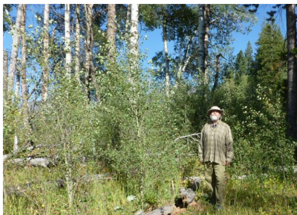
Figure 2. Aspen stand in northern Yellowstone showing overstory aspen trees and young saplings. Lack of intermediate ages and sizes classes is due to the legacy of lack of recruitment due to suppression by herbivory; young saplings in this stand are now taller than the normal browse level of elk and thus likely to grow into new trees.

of aspen recovery. We also measured the five tallest saplings in each stand and found that 46% of stands had one or more taller than 200 cm in the spring of 2012, and 25% of stands had five or more saplings taller than 200 cm, a strong indication that the stand will successfully regenerate by replacing overstory trees (Kay 2001). Most of these tall saplings originated after 2003, an indication that survival and heights of young aspen have recently increased, but this change would have been difficult to detect by random sampling when Kauffman and others did their research.