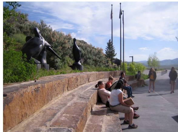
National Wildlife Museum