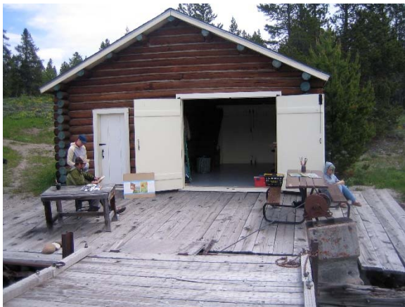
AMK Boat House/ Studio