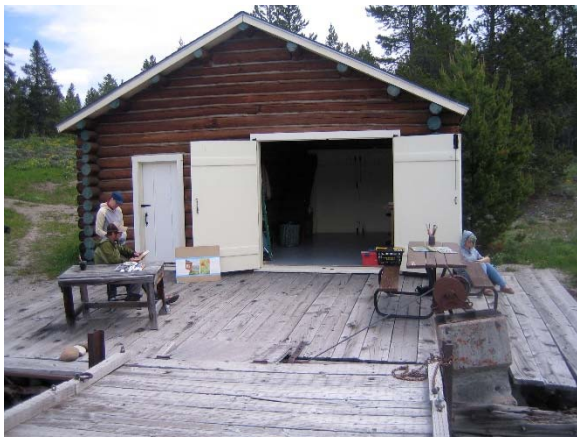
AMK Boat House/ Studio