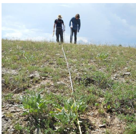
Figure 3. Photograph of a transect for distance sampling at Blacktail Butte (BTB). The two undergraduate researchers are recording host-plant abundance.