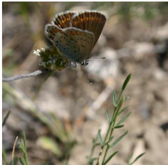
Figure 1. Photograph of a female L. idas butterfly perched above its host plant ( Astragalus miser ) on Blacktail Butte (BTB).

varies among populations and over generations and that this variation is sufficiently large to contribute to the maintenance of genetic variation in L. idas . This report documents the results from the third year of this long-term study. The first year (2012) was a pilot study in which we collected L. idas for DNA sequencing and tested the distance sampling technique to estimate population sizes (population size is an important parameter for our evolutionary models). In our second year (2013) we collected L. idas and started distance sampling at four populations. This year we collected L. idas and used distance sampling at ten populations.