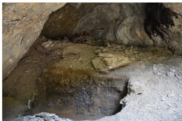
Figure 7. Interior of Painter Cave, showing large excavation unit with stratified packrat midden.

approximately 1x2 m revealed the posterior wall of what appeared to be a disturbed ledge possibly left by looters. The small test units recovered no archaeological material while the possible edge of the looter's pit showed packrat midden stratigraphy and bones with varying degree of modification, both cultural and natural. Chipped stone debitage and one small Late Prehistoric (ca. 300-500 years ago) projectile point were also recovered. All units were dug to sterile levels, which in the case of the larger unit was several meters deep. The stratigraphy of the deep unit informed us more about taphonomic (packrat) disturbances than about improving our understanding of cultural deposits (Figure 7). No obviously cultural perishable materials were recovered, although denning materials from the packrats were present throughout the levels.