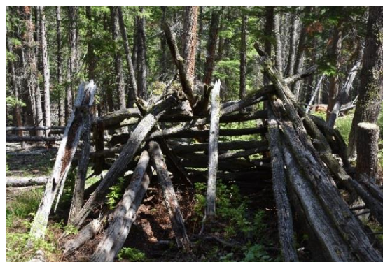
Figure 4. Sunlight Basin Sheep Trap catchpen.

Several important archaeological sites have previously been recorded in the Painter Cave near-vicinity, including Bugas Holding, the Sunlight Basin Sheep Trap, and the East Fork of Painter Gulch lodges (48PA305). The first few days were spent systematically surveying for previously unidentified sites and visiting known site locations. Landforms varied from open alluvial terraces along the creek drainages to wooded foothills. The primary method was a standard archaeological survey inventory using pedestrian transects with 10 meter interval spacing. The field crew visited the Sunlight Basin Sheep Trap and the East Fork of Painter Gulch lodge site, to access the integrity of these rare and unique sites (Figure 4).