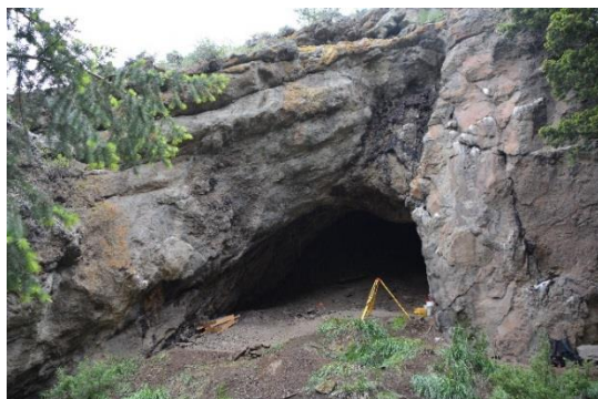
Figure 2. Entrance to Painter Cave.

Although referred to as a cave, Painter Cave is technically a dry rockshelter (Figures 2-3). It has the potential to contain deeply stratified deposits of multiple cultural and natural layers. The extensive use of the shelter by packrats (also called bushy-tailed woodrats, Neotoma cinerea ) informs us about local animal species present through time. Size-sorted debris identified at the entrance of the shelter additionally provides evidence of previous looting activity and could mean that stratified deposits were impacted by the looters.