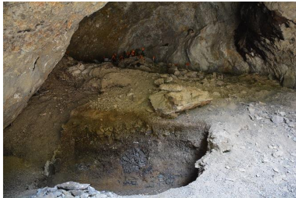
Figure 7. Interior of Painter Cave, showing large excavation unit with stratified packrat midden.

approximately 1x2 m revealed the posterior wall of what appeared to be a disturbed ledge possibly left by looters. The small test units recovered no archaeological material while the possible edge of the looter's pit showed packrat midden stratigraphy and bones with varying degree of modification, both cultural and natural. Chipped stone debitage and one small Late Prehistoric (ca. 300-500 years ago) projectile point were also recovered. All units were dug to sterile levels, which in the case of the larger unit was several meters deep. The stratigraphy of the deep unit informed us more about taphonomic (packrat) disturbances than about improving our understanding of cultural deposits (Figure 7). No obviously cultural perishable materials were recovered, although denning materials from the packrats were present throughout the levels.