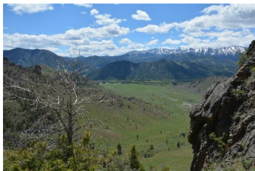
Figure 1. View of Sunlight Basin from project area.

Although referred to as a cave, Painter Cave is technically a dry rockshelter (Figures 2-3). It has the potential to contain deeply stratified deposits of multiple cultural and natural layers. The extensive use of the shelter by packrats (also called bushy-tailed woodrats, Neotoma cinerea ) informs us about local animal species present through time. Size-sorted debris identified at the entrance of the shelter additionally provides evidence of previous looting activity and could mean that stratified deposits were impacted by the looters.