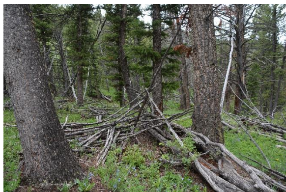
Figure 5. Collapsed lodge at the East Fork of Painter Gulch site.

Our team re-visited the site as part of the 2014 project (Figure 5). We re-identified the four collapsed lodge structures, drew scientific illustrations of each, and metal detected the site. Because the site is unburned and located in a forested environment, the mountain duff and pine needles are several cm thick throughout the site, making surface artifact visibility nearly impossible.