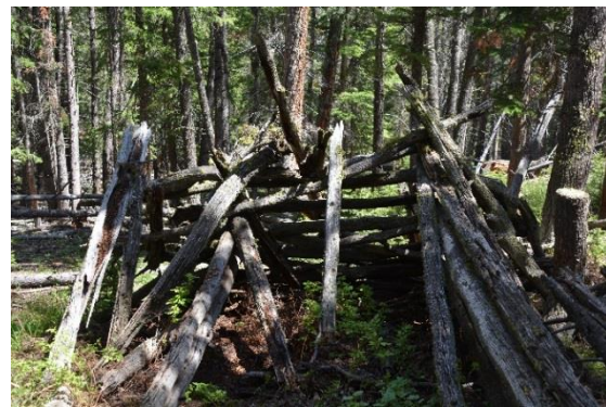
Figure 4. Sunlight Basin Sheep Trap catchpen.

Several important archaeological sites have previously been recorded in the Painter Cave near- vicinity, including Bugas Holding, the Sunlight Basin Sheep Trap, and the East Fork of Painter Gulch lodges (48PA305). The first few days were spent systematically surveying for previously unidentified sites and visiting known site locations. Landforms varied from open alluvial terraces along the creek drainages to wooded foothills. The primary method was a standard archaeological survey inventory using pedestrian transects with 10 meter interval spacing. The field crew visited the Sunlight Basin Sheep Trap and the East Fork of Painter Gulch lodge site, to access the integrity of these rare and unique sites (Figure 4).