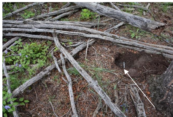
Figure 6. Musket ball at edge of lodge under thick forest duff.

Most of the identified metal artifacts were food cans, horseshoes, round nails, beverage pull tabs, a gum wrapper, and unidentified metal, which speak to the site's historic and modern impacts. The most interesting item was a .53 caliber lead musket ball that was found on the edge of Lodge 2 (Figure 6). It was likely fired from a smooth bore musket and dates to the nineteenth century. This size musket ball was popular in many hunting guns of the early historic era, although they technically could still be used today. The musket ball might be associated with the residential structure, given their similar ages and their proximity to one another.