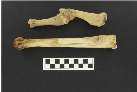
Figure 9. Bones exhibiting pathologies. Coyote tibia on top, bighorn sheep metatarsal on bottom.

Some of the faunal remains showed signs of possible cultural modification. Ninety-four (17%) of the bones were burned, with various levels of severity. Burning is not always caused by human cooking and discard activities, but often is, especially since there is no evidence of forest fires in the area around the cave. The presence of burned bone indicates primary deposition of people living in or near the cave. Almost all of the burned bones are medium artiodactyls such as bighorn sheep. In addition to burning, several bones (n=10) showed signs of cutmarks, created during past butchery activities. Although this number is not high, the rodent gnawing could have obfuscated the cutmarks.