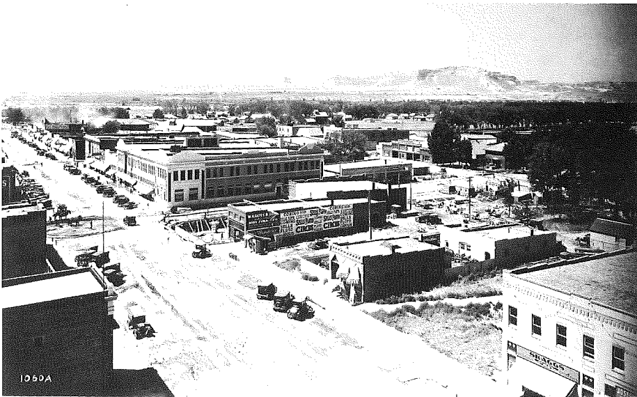
As seen from the town of Scottsbluff in July 1925, Scotts Bluff rises to signal Nebraska's nearby western border. Scotts Bluff's status as monument was confirmed in 1919 when President Woodrow Wilson designated it as Nebraska's first national monument.

Big Twelve, a conference with members from the "Midwest," although one key traditional rivalry always has been with the University of Colorado, clearly from the "West."